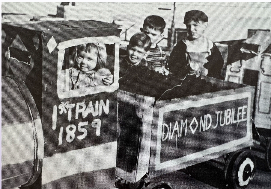
FLEETWOOD'S 75TH CELEBRATION