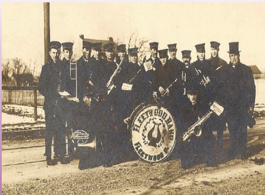
THE FLEETWOOD BAND