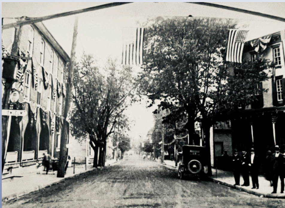
MAIN STREET, FLEETWOOD - 1948