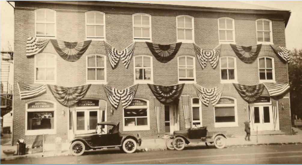
THE ORIGINAL HOTEL FLEETWOOD