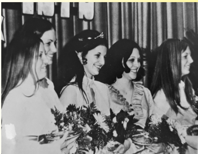
1973 CENTENNIAL QUEEN AND ATTENDANTS