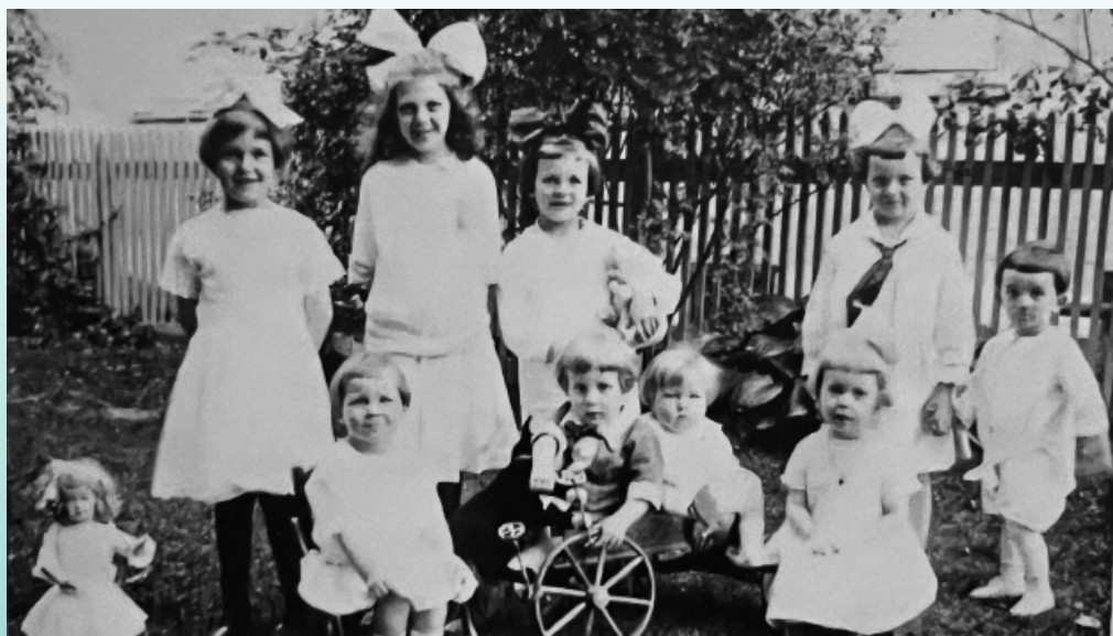
KIDS PLAYING IN 1948 IN FLEETWOOD