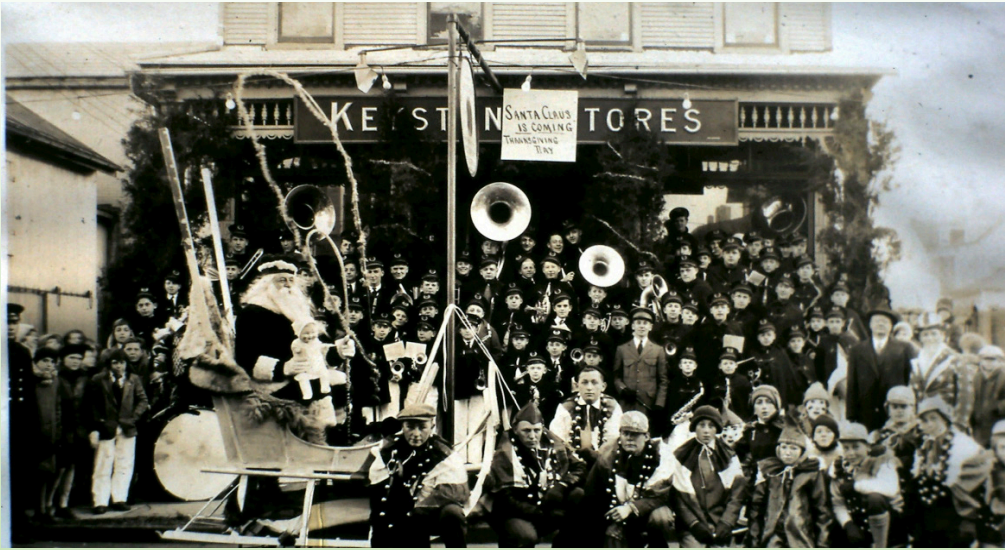
SANTA AT STRAUSE'S STORE ON THANKSGIVING DAY