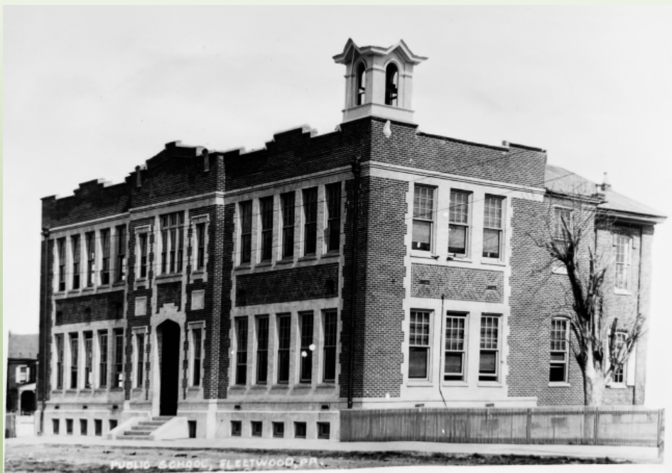
ORIGINAL FLEETWOOD SCHOOL ON ARCH STREET