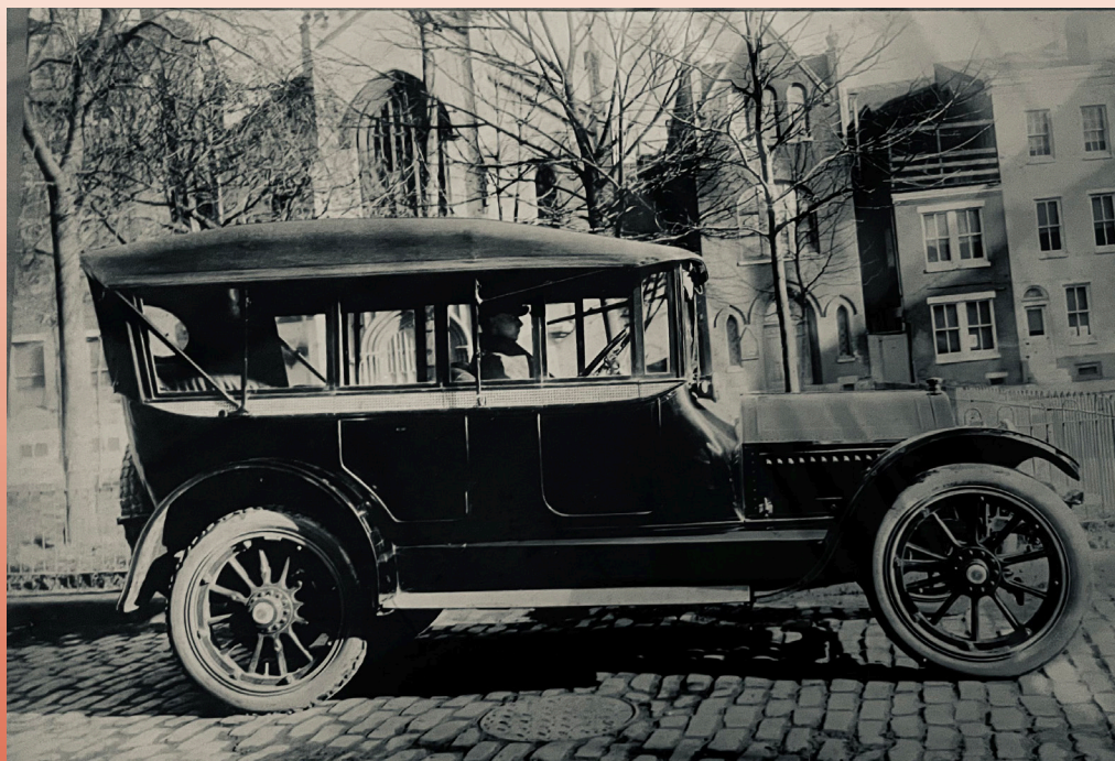
FLEETWOOD AUTO BODIES CADILLAC CAR