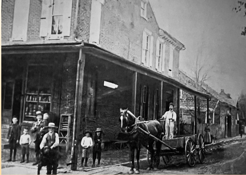
GENERAL STORE ON MAIN STREET