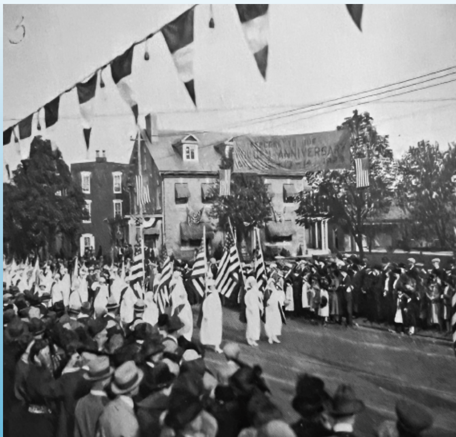
FLEETWOOD 75TH ANNIVERSARY PARADE