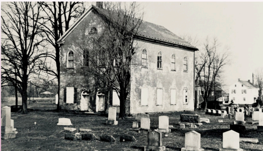
ST. PAUL'S OLD REFORMED CHURCH ON MAIN STREET