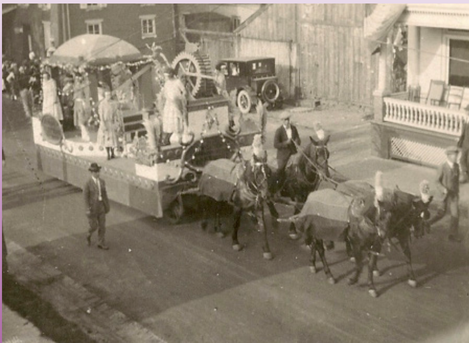
THE 50TH ANNIVERSARY PARADE IN FLEETWOOD