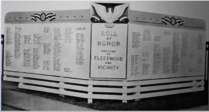
WORLD WAR II MILITARY SERVICE BOARD